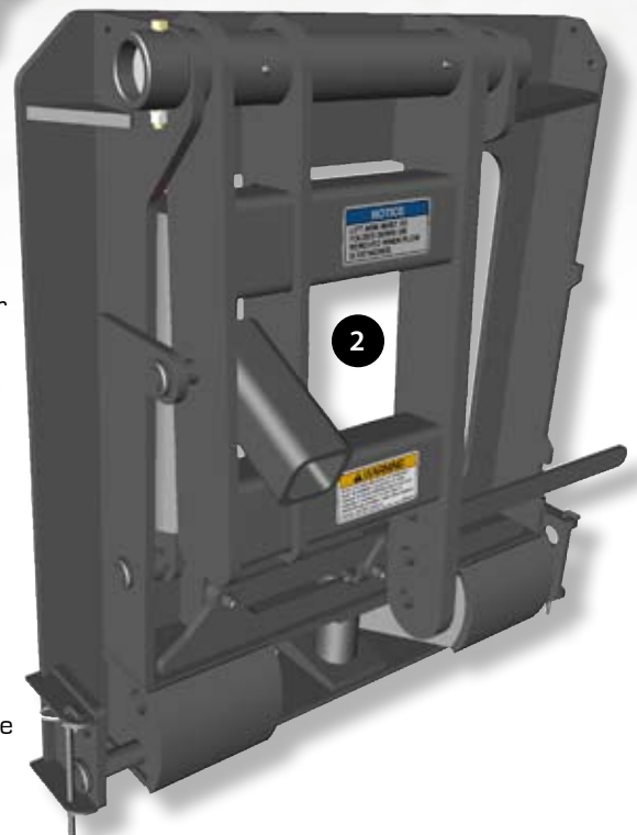
Fig. 2: QX Hitch shown in the lowered or stowed position.

Versatility, safety, and easy operation are all features built into the QX Hitch from Bonnell. This heavy duty hitch features an off center lift cylinder for installation with or without a front mount pump, and is designed to allow the lift cylinder to swing up, and the lift arm to fold down when not in use.