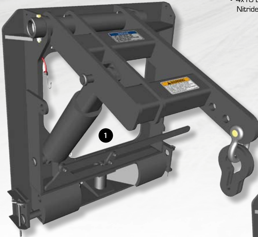
Fig. 1: QX Hitch shown in the operating position.