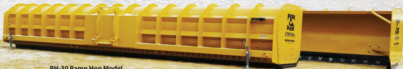
RH-30 Ramp Hog Model With CAT® Fusion™ Coupler